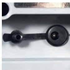
Power input protection